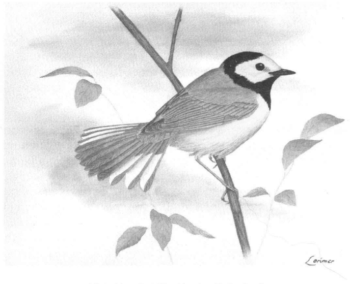
Male Hooded Warbler

Warbler Weather: Fallouts are mass groundings of migrants that come north with warm (often moist) airflows from the Gulf