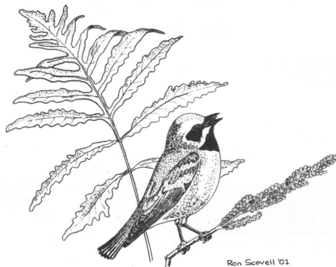
Male Golden-winged Warbler on Sensitive Fern

moment in the last trees. Many small birds go out only a short distance over Lake Erie, returning to the Tip to try again several times. Other birds leave the Tip, appearing to head towards Pelee Island, but they often curve back northward to land along the west beach. Some birds probably reach Pelee Island and/or Ohio. One theory says this reverse migration comprises disoriented birds in early morning that are following the shoreline of Point Pelee to the Tip. Another theory says that some of the birds in reverse migrations have gone too far north (overshot) and are returning south. Lewis (1939) described a major reverse migration on 12 May 1937 at the southern tip of Pelee Island. At 7:00 a.m., Lewis noted that a fresh wind was blowing from the south at 15 miles an hour. The birds were flying into the wind out over the water toward the next island, Middle Island. He concluded that "many of the birds that were flying south from Pelee Island that morning, such as the Blue-headed Vireos, Magnolia Warblers, Cape May Warblers, Myrtle Warblers, Bay-breasted Warblers, Blackpoll Warblers, and Pine Siskins, do not nest in the regions lying southward from the island and therefore were not heading toward the destination of their migration." However, a few species, such as Summer Tanager, may be "southern overshoots" that are returning south. The causes of reverse migrations at Point Pelee and Pelee Island remain speculative.