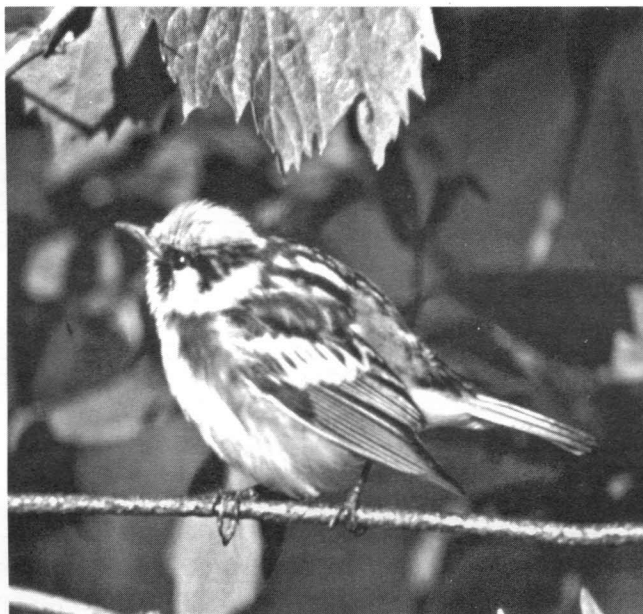
Male Chestnut-sided Warbler by Sam Barone

Northern Parula: An uncommon to rare migrant during the second and third weeks of May. Often first detected by its buzzy rising trill zeeeeeeeeee-WIP , ending abruptly louder. Alternate song, usually sung more on the breeding grounds, is also a buzzy rising trill zh-zh-zh-zheeeeeee . Usually sings and feeds from a medium to high perch near the tips of branches. Sometimes feeds by clinging upside-down, showing its greenish yellow back