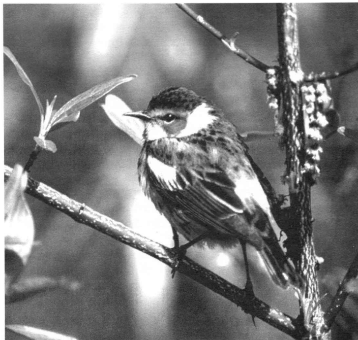
Male Cape May Warbler by Sam Barone

Yellow-rumped Warbler: Most abundant Ontario warbler. Earliest spring warbler, with a few arriving in late March in southern Ontario, but surprisingly no more regular in late March at Point Pelee than elsewhere. Common from mid-April to mid-May in southern Ontario. Not a secretive warbler, it is easily seen. Prefers open woods and forest edges, usually feeding at medium heights, but also seen flycatching at the tops of trees. Some days in early May, Yellow-rumps and Ruby-crowned Kinglets are in every tree at Point Pelee, making the search for other species a chore. Song is a loose tinkling trill that rises or falls at the end. Learn its distinctive chep call note to identify flying birds. Taxonomy: Myrtle and Audubon's Warblers were lumped into Yellow-rumped Warbler by the American Ornithologists Union in 1973 because of interbreeding. Yellow-rumps in Ontario are the eastern Myrtle Warbler form which has a white throat, but an occasional western Audubon's Warbler form is seen with a bright yellow throat, more white in wingbars, different face pattern, and more white in the